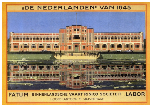
Above: H.P. Berlage, Drawing of a house in Batavia (1923); Below: H.P. Berlage, De Nederlanden van 1845 (The Hague, 1924/1927)